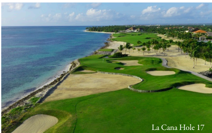
La Cana Hole 17