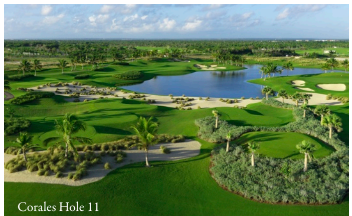
Corales Hole 11