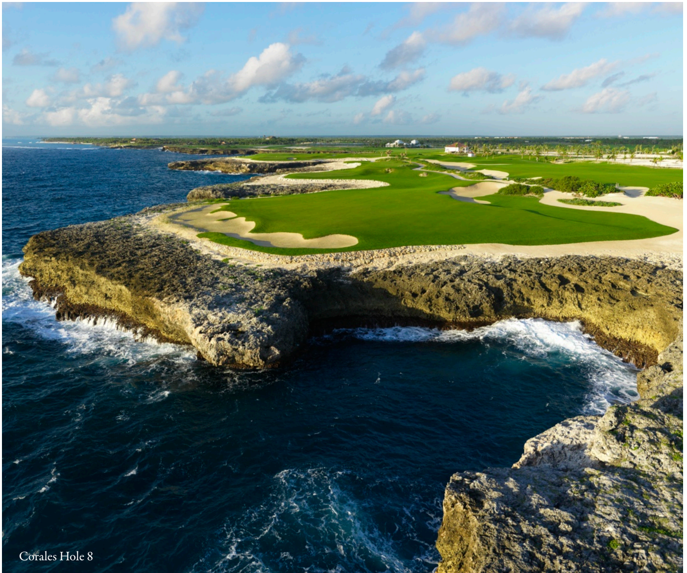
Corales Hole 8