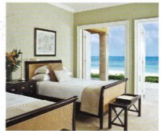
Book a stay at boutique hotel Tortuga Bay (also shown on Page 26) in Punta Cana in the Dominican Republic.

A flight to Zimbabwe takes travelers to spectacular Victoria Falls. Chobe National Park, home to elephants, antelopes and buffaloes, is next, then on to Moremi Game Reserve, the "predator capital" of Botswana, to glimpse lions, cheetahs, hyena and sand leopards. The trip concludes in the cosmopolitan capital, Johannesburg. ( www.abercrombiekent.com )