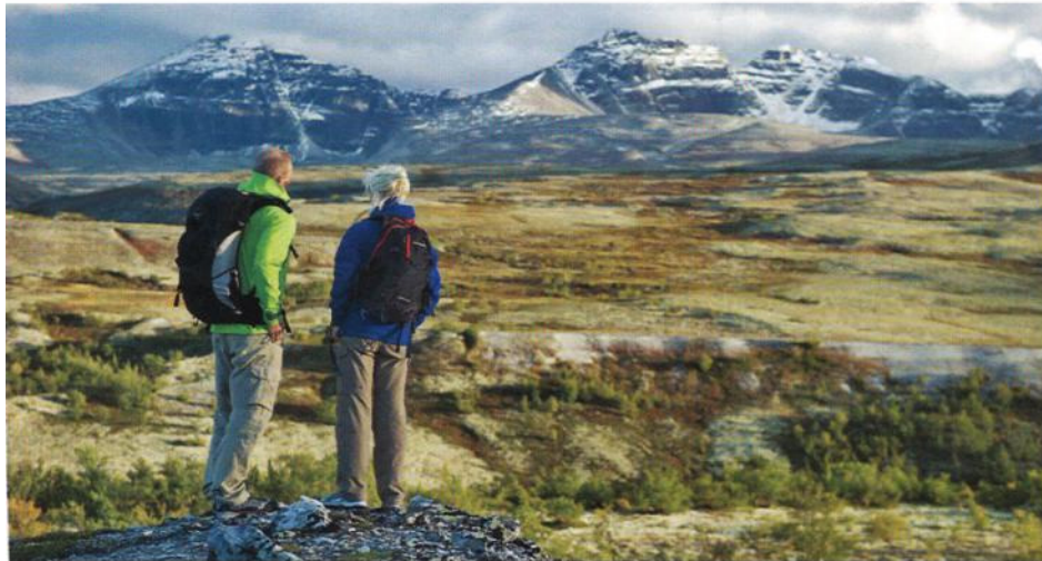
Norway offers breathtaking views and abundant outdoor pursuits.