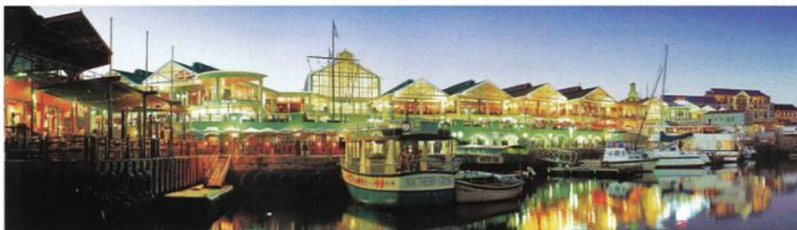
The V&A Waterfront in Capetown is South Africa's most visited destination — a combination of shops, restaurants, nightspots, tourist attractions and museums in the city's historic harbor.

But Norway has more to offer than magnificent scenery — the richest fishing in the world, for one thing, plus sailing, hiking and mountain climbing. For the truly adventurous, there are pursuits such as heli-skiing, paragliding and bungee jumping. The best way to enjoy all this is to rent a place, perhaps one of the handsome Hansnes Fjordside Cabins, and stay awhile. ( www.visitnorway.com , www.holidaynorway.com for cabin details)