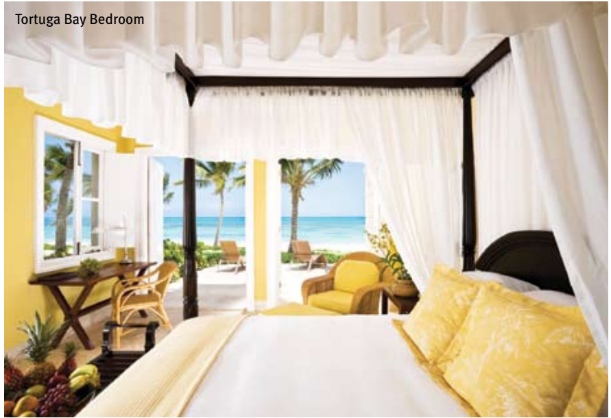
Tortuga Bay Bedroom