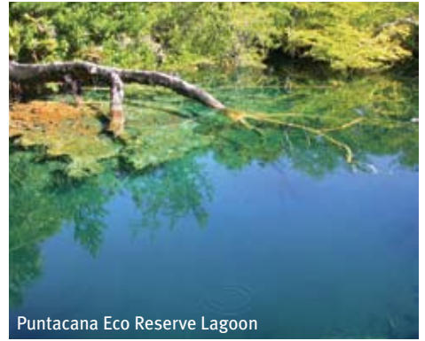
Puntacana Eco Reserve Lagoon