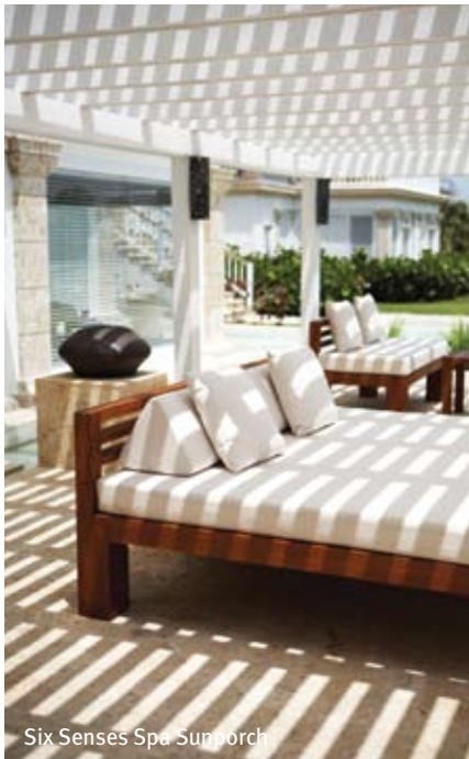
Six Senses Spa Sunporch

A few days in, thoroughly distracted by the resort's pulls such as its Segway tours and Six Senses Spa, I am reminded of the main reason I'm here: to witness the grand opening of the Corales golf course, which welcomes a prestigious crowd of local notables, the