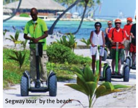
Segway tour by the beach

...explore the 1,500 acres of trails that lead you to the 15 natural spring water swimming lagoons along the way.