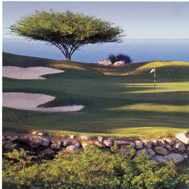
Could this be love? The White Witch is Jamaica's most challenging course.

The Dominican Republic is hot, and the pace of openings seems likely to establish the country as the region's choice golf destination. The course that has gotten the most attention recently is Punta Espada, the first at Cap