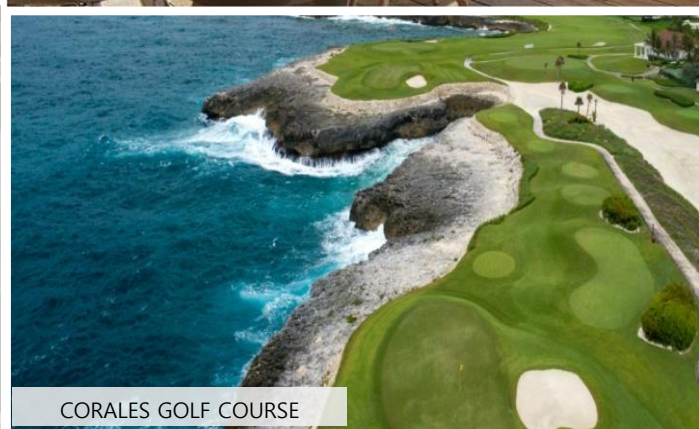
CORALES GOLF COURSE