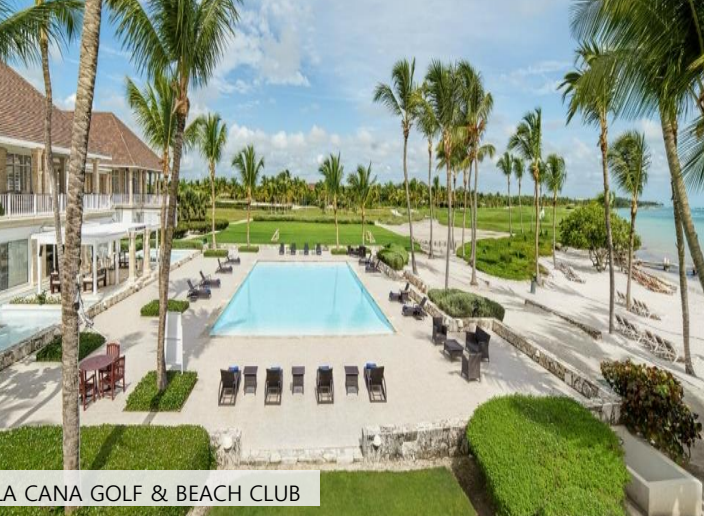
LA CANA GOLF & BEACH CLUB