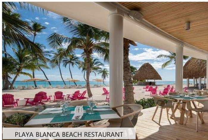
PLAYA BLANCA BEACH RESTAURANT