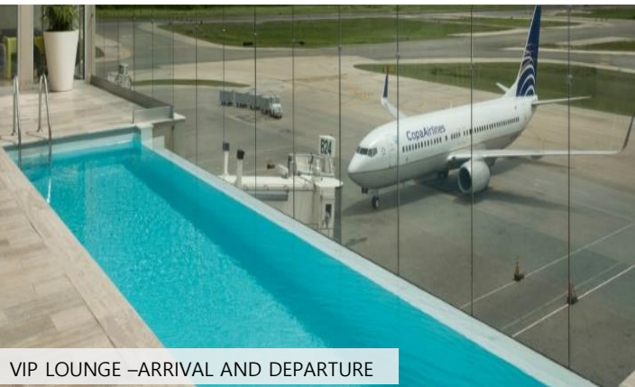
VIP LOUNGE –ARRIVAL AND DEPARTURE