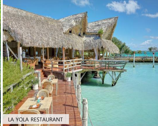
LA YOLA RESTAURANT