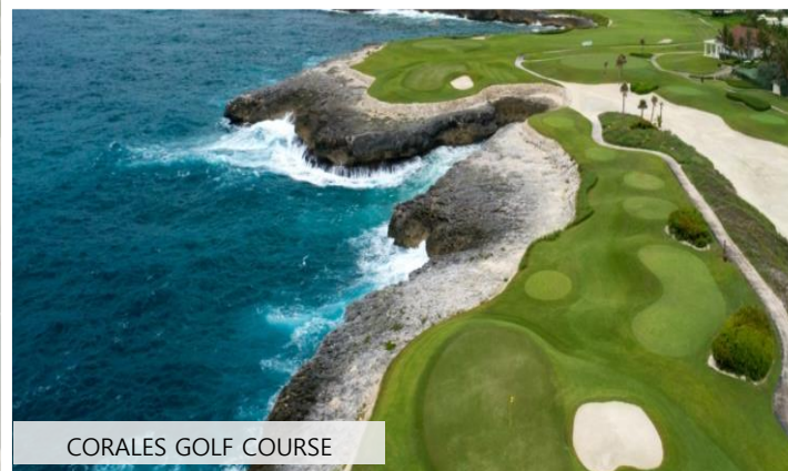
CORALES GOLF COURSE