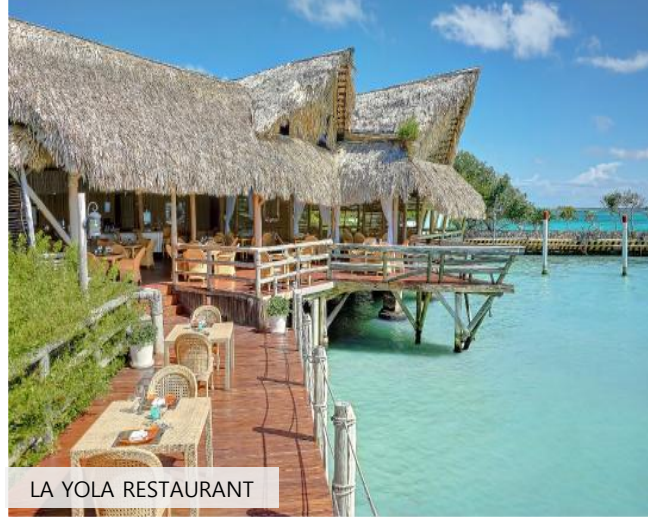
LA YOLA RESTAURANT