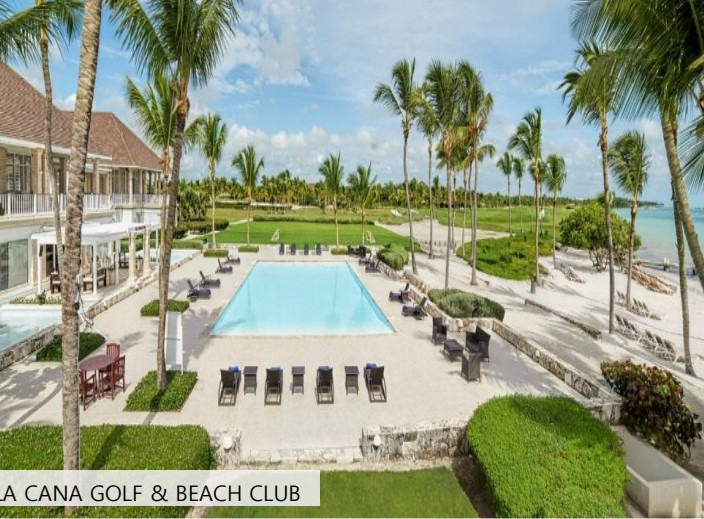
LA CANA GOLF & BEACH CLUB