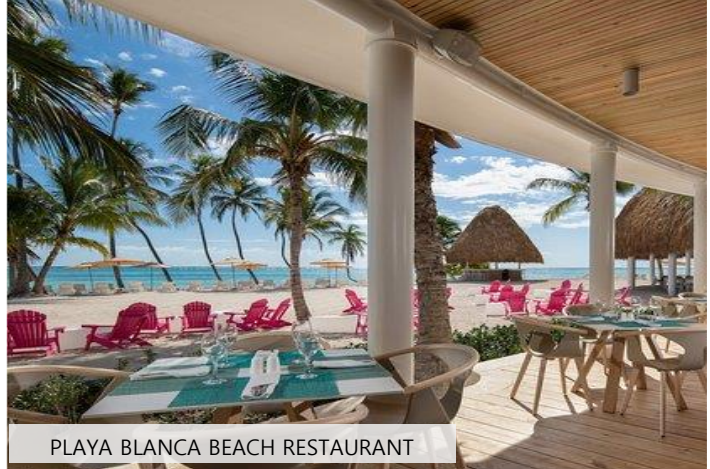
PLAYA BLANCA BEACH RESTAURANT