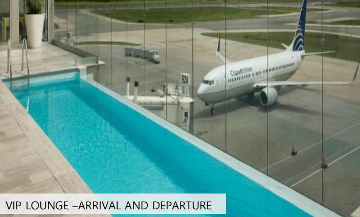
VIP LOUNGE –ARRIVAL AND DEPARTURE